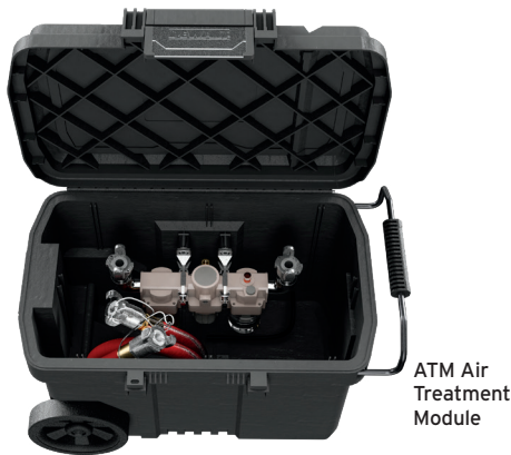
ATM Air Treatment Module