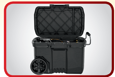
Both ATM & ACM feature a strong, water tight case with wheels & extendable handle

The more economical choice is the Air Treatment Module (ATM) Part# 69-4102-01. It includes the same filters, regulators and oilers in the same case as the ACM, but dispenses with the CE air logic control and remote control pendant. Like the ACM, the ATM offers high air flow capacity for use with even the most air-hungry drive motors. It is used with “control handle” air motors.