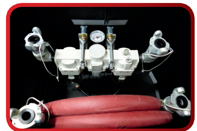
ATM Air treatment module includes the same filters, regulators and oilers as ACM