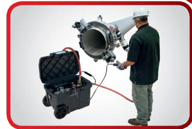
ACM moves the operator up to 16ft (4.8m) from the workpiece