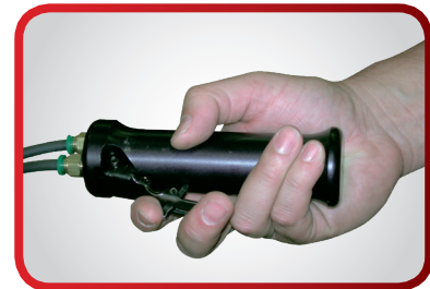
Remote control handheld pendant controls air motor operation and speed