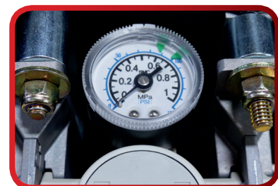
Pressure regulator lockable at desired pressure, 116 psi (8 bar) maximum setting