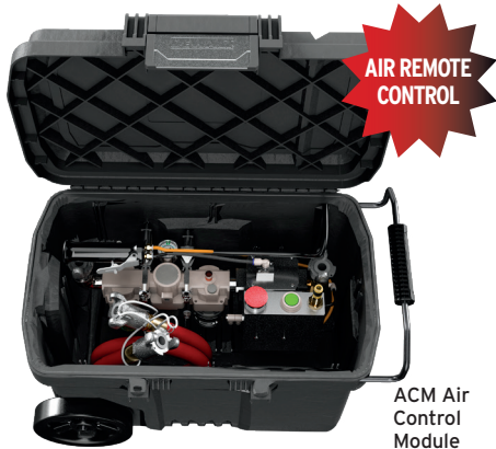
ACM Air Control Module